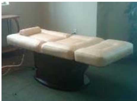
Pedi Lounger shown in flat position. Use for mini massage or face down treatments.