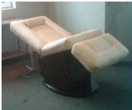
Pedi Lounger shown in zero gravity position. Use for relaxation or facials.