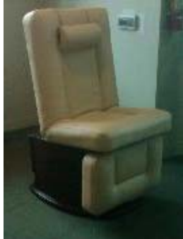
Pedi Lounger shown in sitting position. Use for pedicure applications.